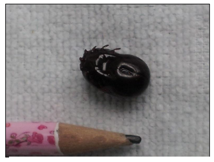
Brown Dog Tick

Other hazards to dogs are a little harder to see. There are many parasites that can affect your dog, both internally and externally. Ectoparasites include black flies, fleas, ticks, and lice. They are quick to spread and easily transferred to your dog from other pets, wildlife, tall grasses or plants, and sometimes even from your clothes. While most of the time these external parasites are fairly harmless, in some cases your pet can have a severe allergic reaction, or can contract serious illness such as Lyme disease.