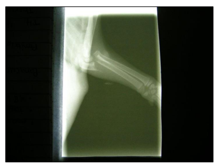
Broken Radius and Ulna Bones