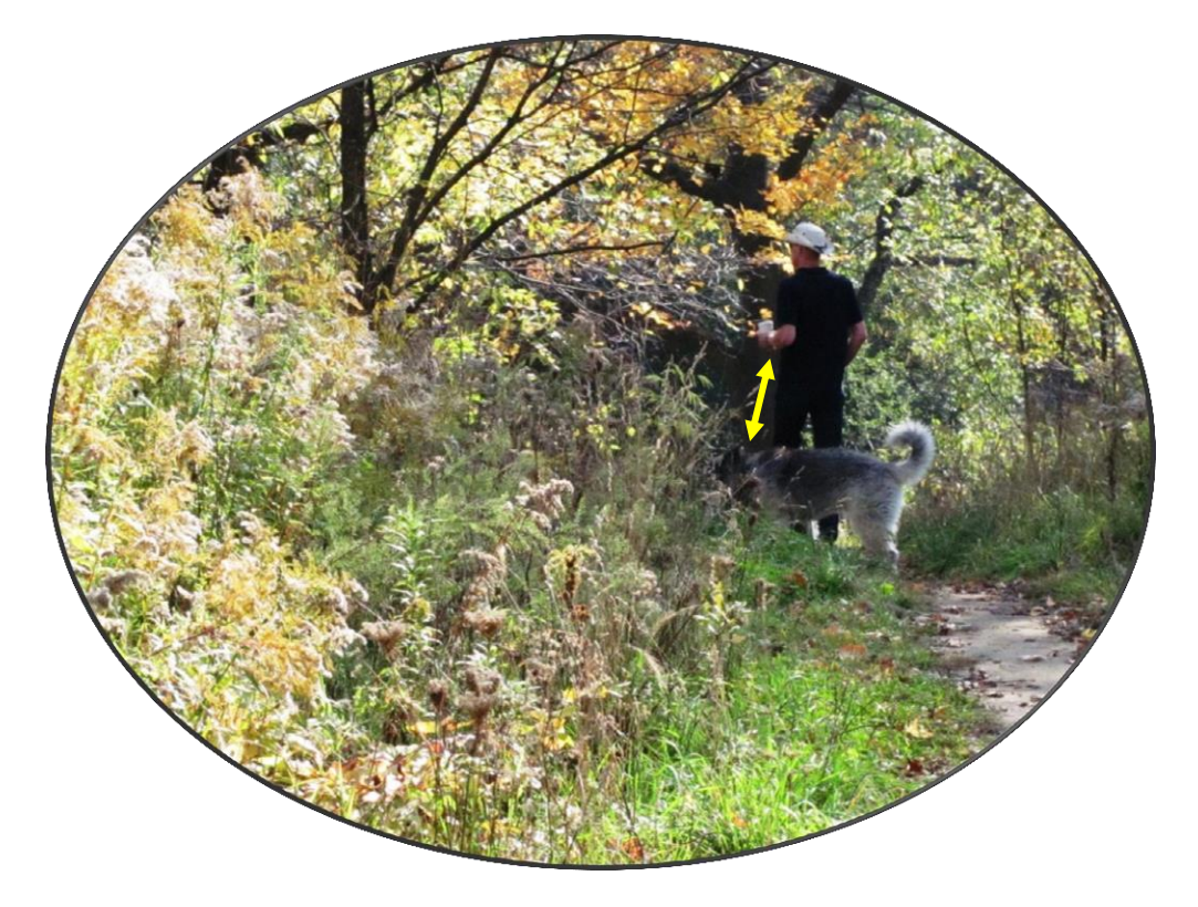
For everyone's safety, please leash your pet outside designated off-leash areas

All dogs and their people are encouraged to take full advantage of the facilities, trails, and breathtaking wilderness of High Park. To keep our pets safe and healthy and to preserve the park's natural beauty for generations to come, we must all share in the responsibility of following the rules set out for us by park staff. Be conscious of the risks to your dogs and to the park when you leave your pets unattended in areas that aren't designated as off-leash. If you have any questions or concerns about your pet's health and safety, or if you would like more detailed information about anything in this article, please contact your veterinarian's office for the most accurate, up to date information.